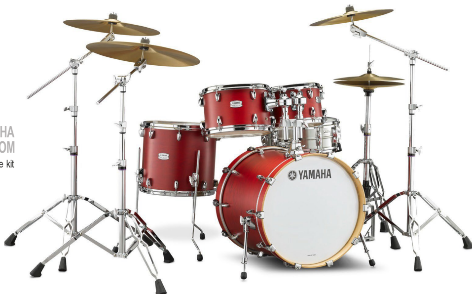
YAMAHA TOUR CUSTOM A typical 5-piece kit